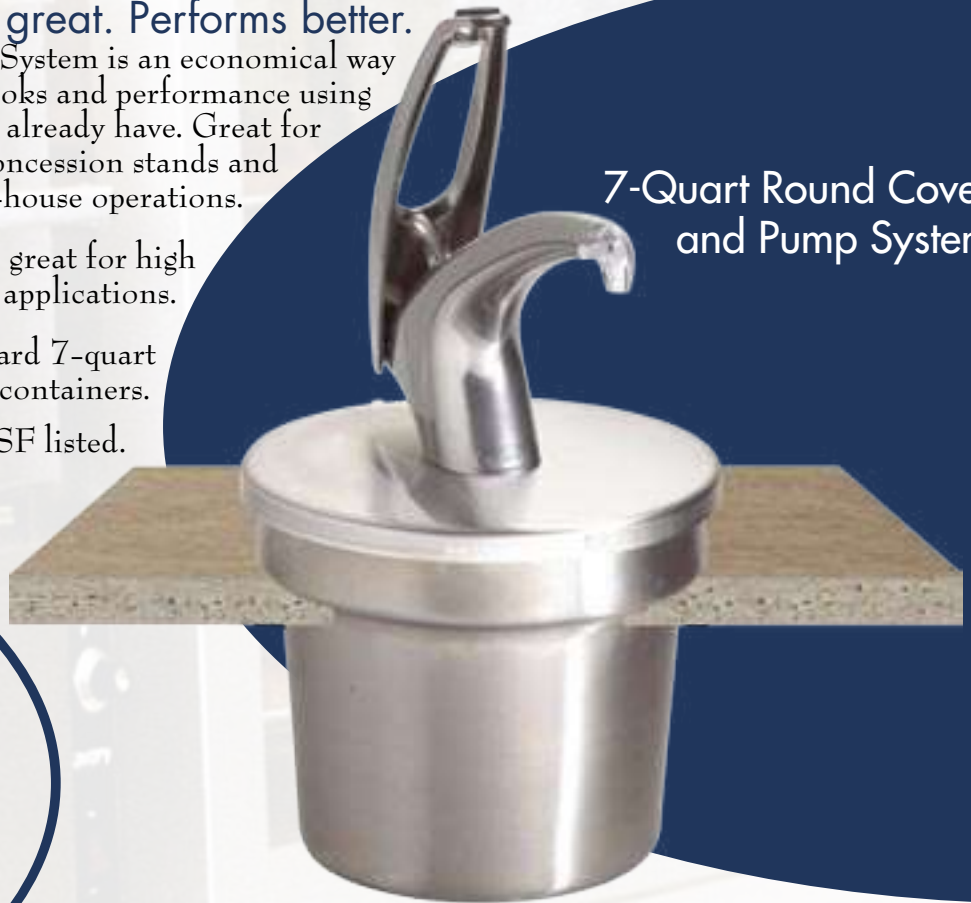
Round Container Not Included.