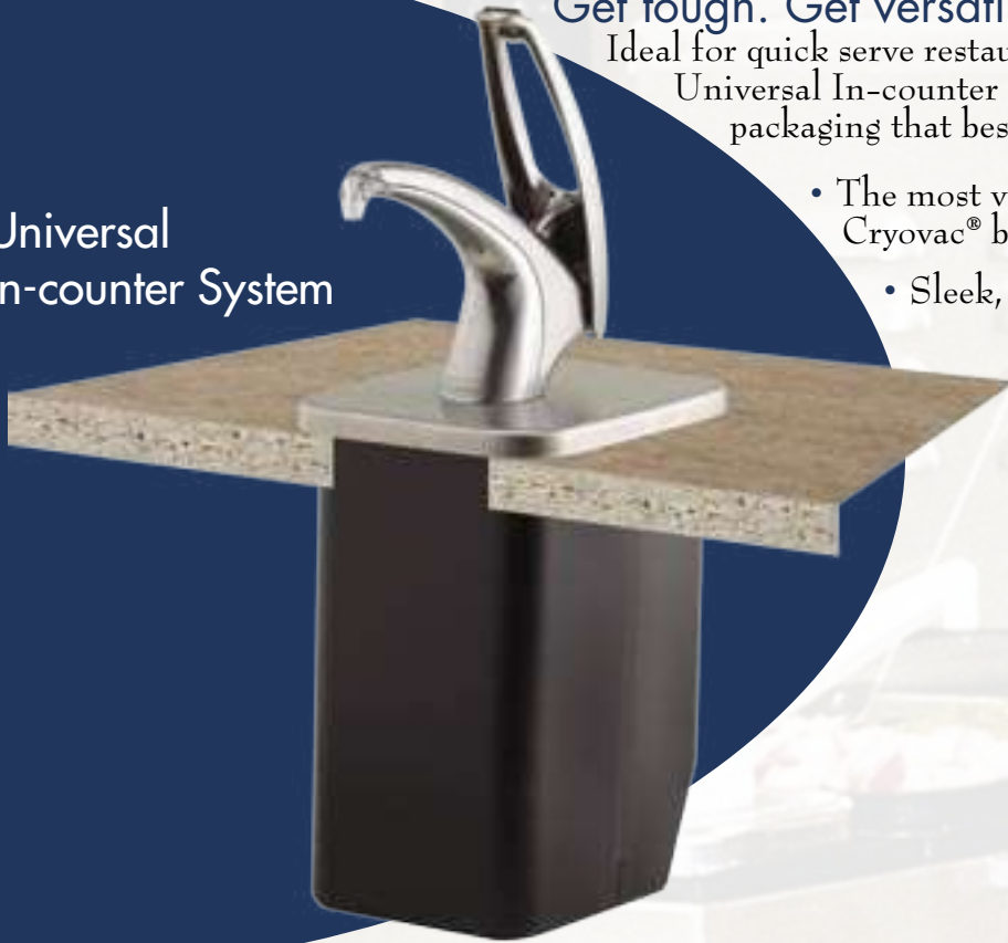
Universal In-counter System

Ideal for quick serve restaurant chains and concession stands, the Universal In-counter System gives customers options for using packaging that best fits their needs.