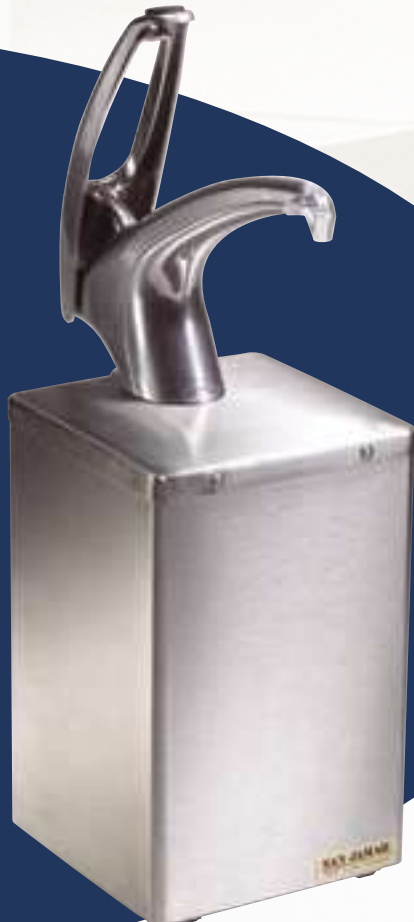
Countertop Box System

All systems come complete with a tamper resistant spring latch.