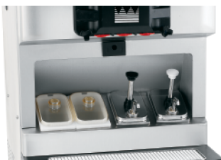
Integrated Syrup Rail Option

2 room temperature with lids & ladles, 2 heated with syrup pumps