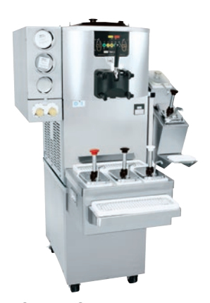
Optional Cart with rear door for front mount syrup rail