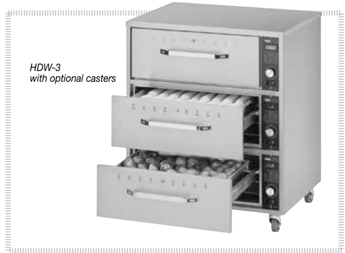
HDW-3 with optional casters