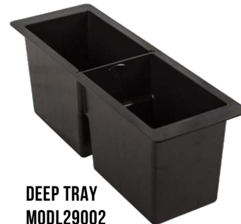
DEEP TRAY MODL29002