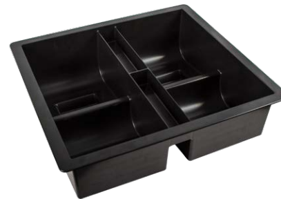
MINI DOME INSERT MODBD20021

6.05"H x 18.61"W x 16.88"D (154 x 473 x 429 mm)