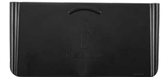
INTERCHANGEABLE TRAY DIVIDER