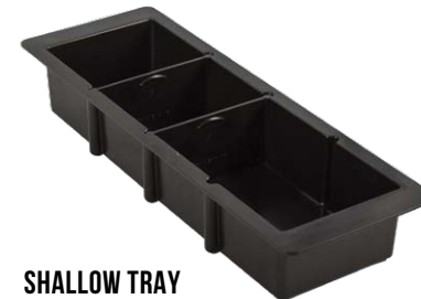
SHALLOW TRAY MODL29001