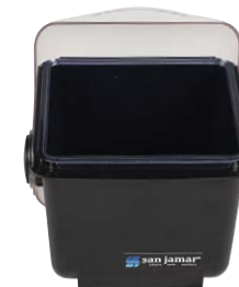
MINI DOME BD2002 (INCLUDES SHALLOW TRAY)