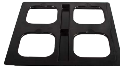
MODPAN INSERT MODMP161

1.25"H x 18.61"W x 16.88"D (32 x 473 x 429 mm)