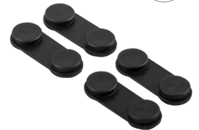
RUBBER LINKING FEET