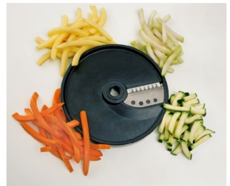
Vegetable sticks (BT)