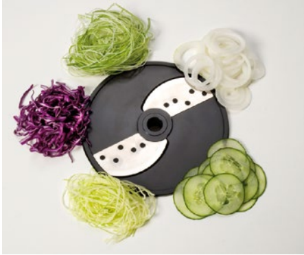
Fine cut (F)