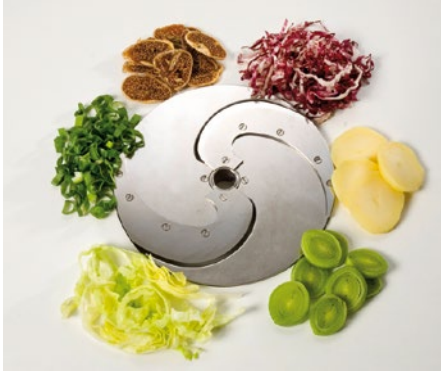
Sickle blade (SM)

SM 1,5 mm SM 3,5 mm SM 5,5 mm SM 2,5 mm SM 4,5 mm SM 6,5 mm