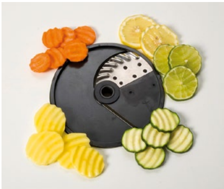
Wave cut (SU)