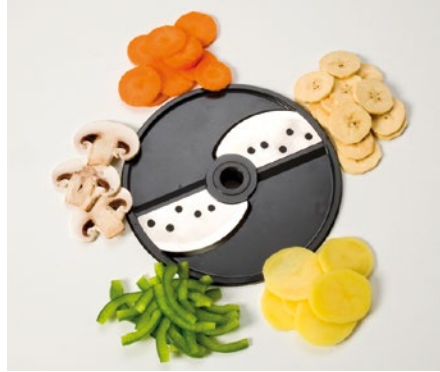
Coarse cut (G)

G3 3 mm G6 6 mm G10 10 mm G4 4 mm G8 8 mm G12 12 mm