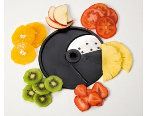
Tomato slicer (TO)

G3 3 mm G6 6 mm G10 10 mm G4 4 mm G8 8 mm G12 12 mm