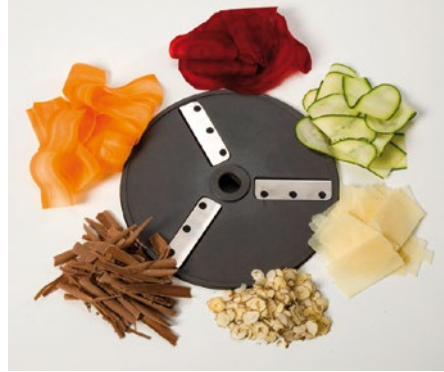
Shaving cut (HS)

SM 1,5 mm SM 3,5 mm SM 5,5 mm SM 2,5 mm SM 4,5 mm SM 6,5 mm