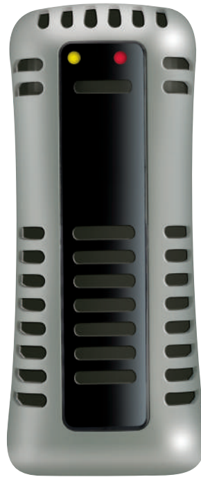
WF107 80 1204 (Gray) WF107 80 1206 (White)