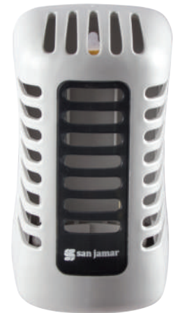
WP107 80 1202 (Gray) WP107 80 1203 (White)