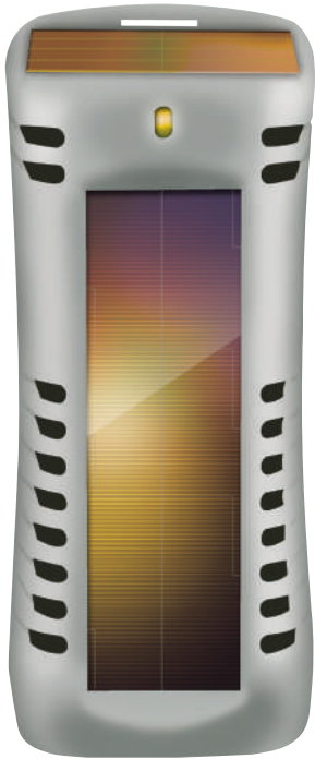
WS107 80 1207 (Gray) WS107 80 1208 (White)