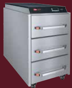
CDW-3N Drawer Warmer