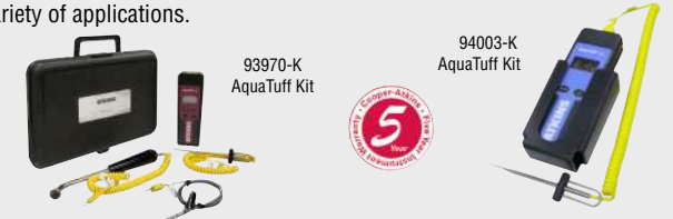
93970-K AquaTuff Kit

The AquaTuff™ 350 Series Thermocouple Instruments are IPX7 waterproof rated and also support interchangeable probes for a wide variety of applications.